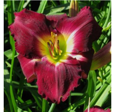
“Dotty’s Distinctive Flair”